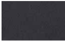
Dark Grey C38 Y2M32I