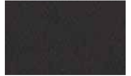
Black C35 Y2M36I