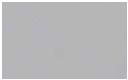
Silver C01 Y2M34I