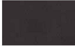
Dark Bronze C34 Y2M30I