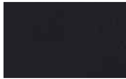
Black 05 Y2M33I