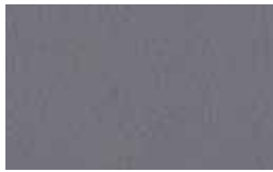
Light Grey C36 Y2M31I